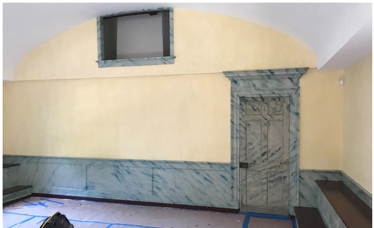
After wall and woodwork treatment