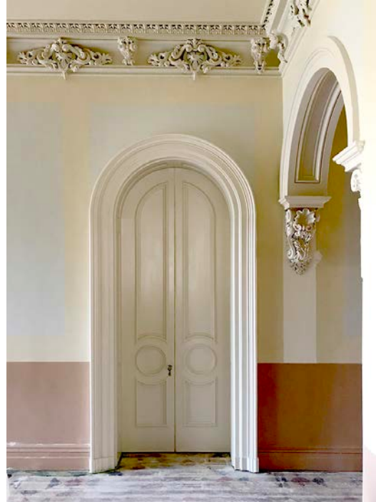
Hall walls and doors after treatment