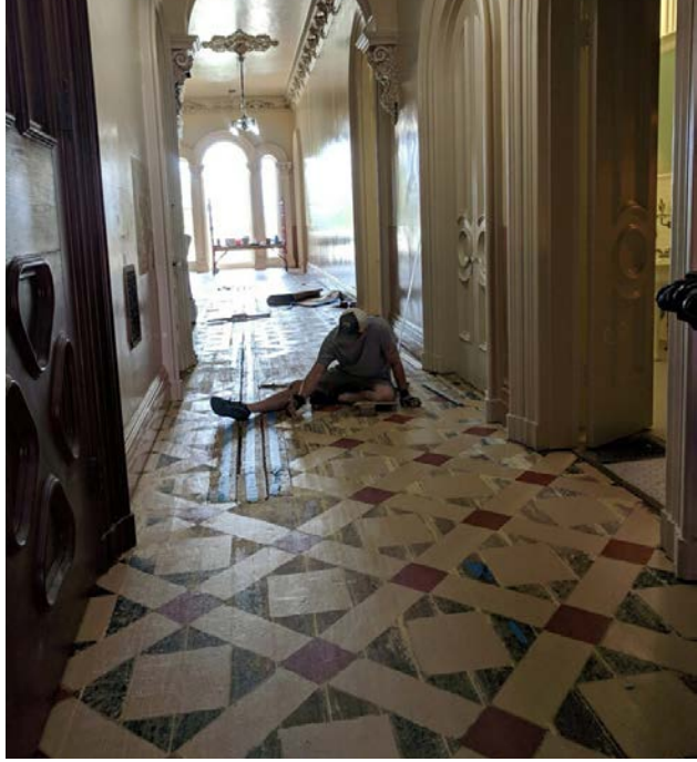
During floor restoration