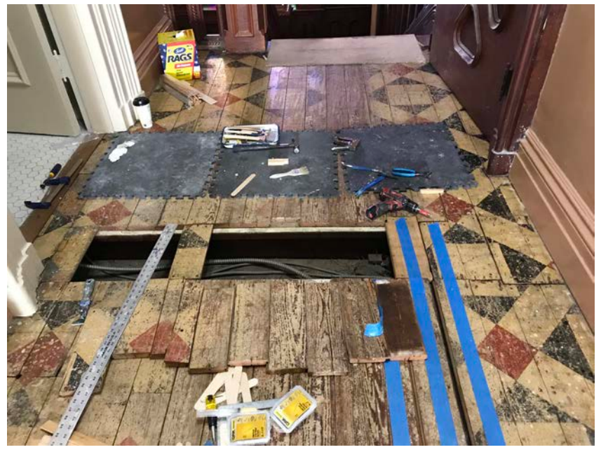
During floor restoration