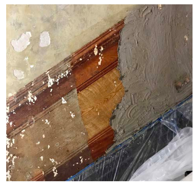
Overpaint removal to recover original graining