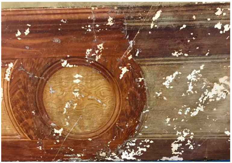
Original graining left, 2nd graining overpaint right