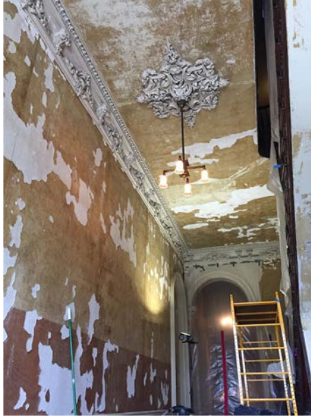
Conditions before treatment